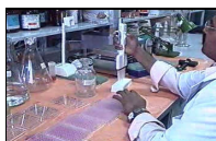
Anti Cancer Drug Screening