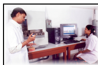
DNA Sequencing & Mutation Analysis