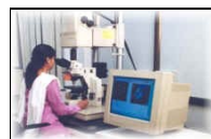
Laser Confocal Microscope