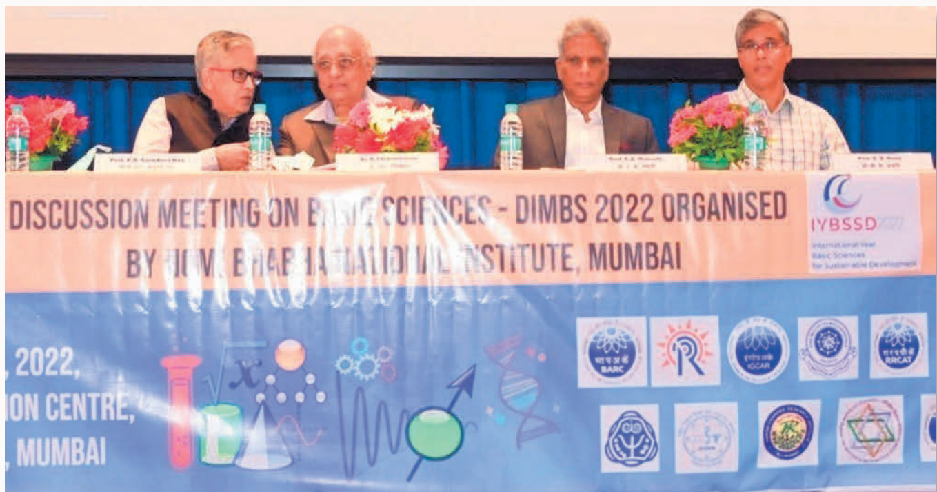
Dignitaries on the dais during the inaugural session of DiMBS-2022