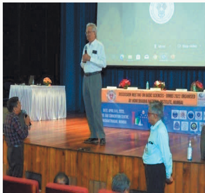
Prof. Anil Kakodkar, Chancellor, HBNI delivering his talk (left) and interacting with audience during DiMBS-2022 (right).