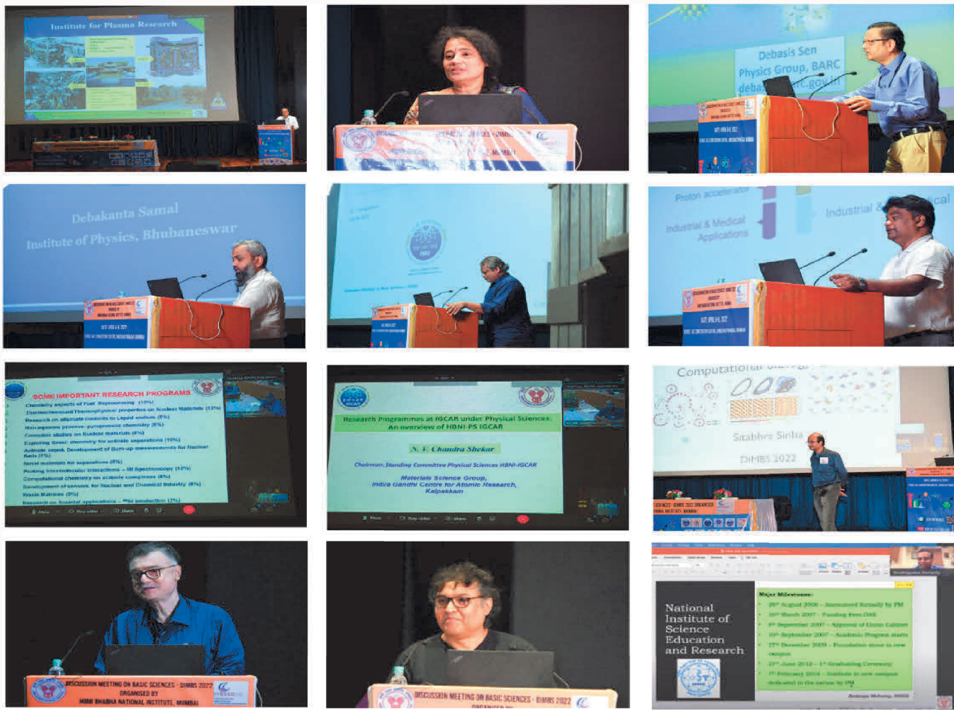
Faculty from different CI/OCC of HBNI giving their presentations during the technical sessions of DiMBS-2022