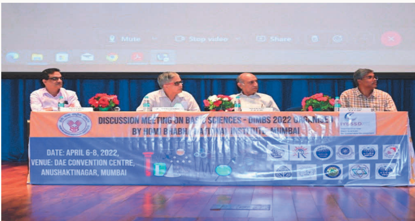
Dignitaries on the dais during the valedictory session of DiMBS-2022