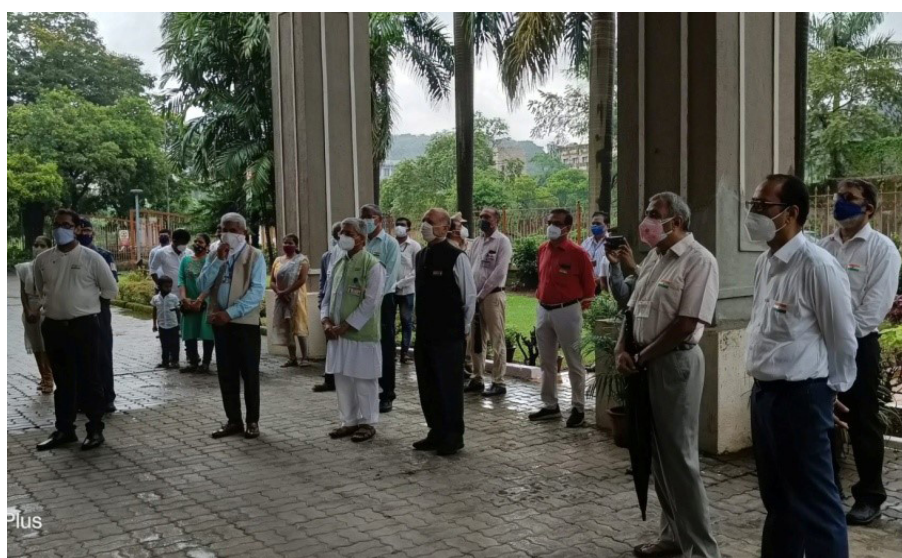
HBNI staff members present on the occasion