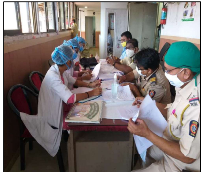
Registration and obtaining Informed consent