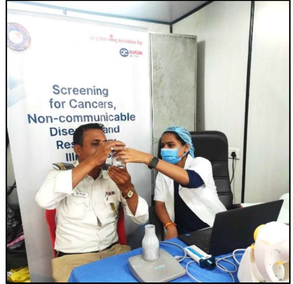
Performing Breath CO