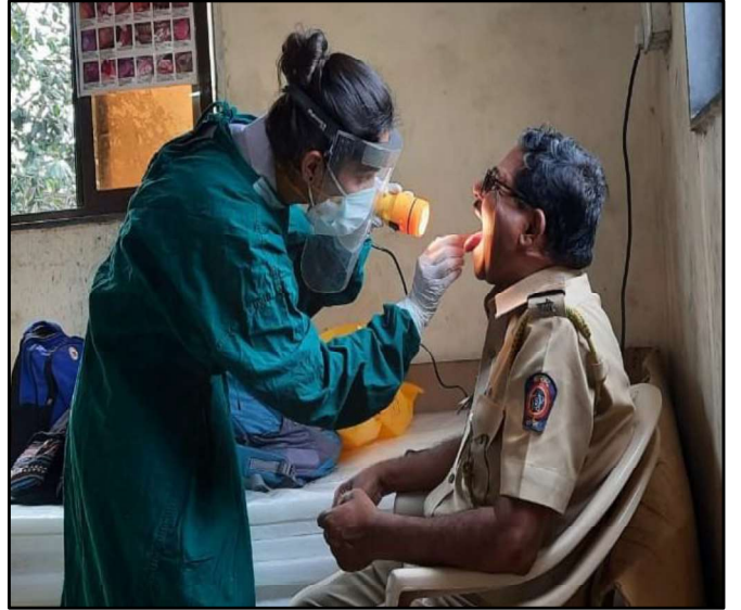
Oral Cavity Examination by Health Assistant