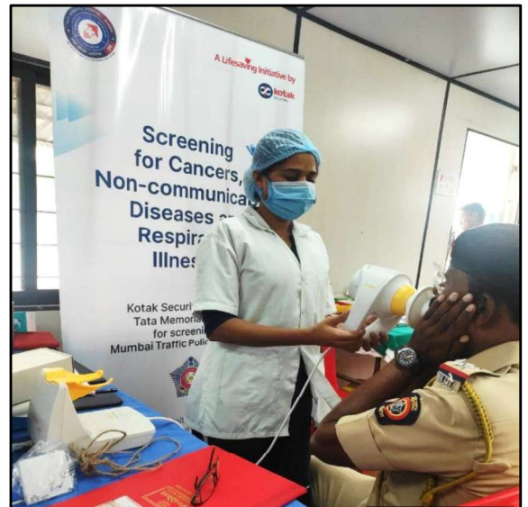
Performing FOT Test