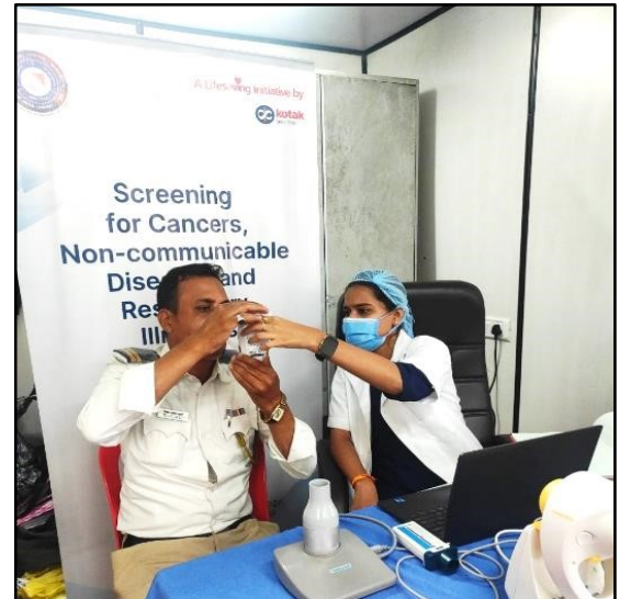
Performing Breath CO