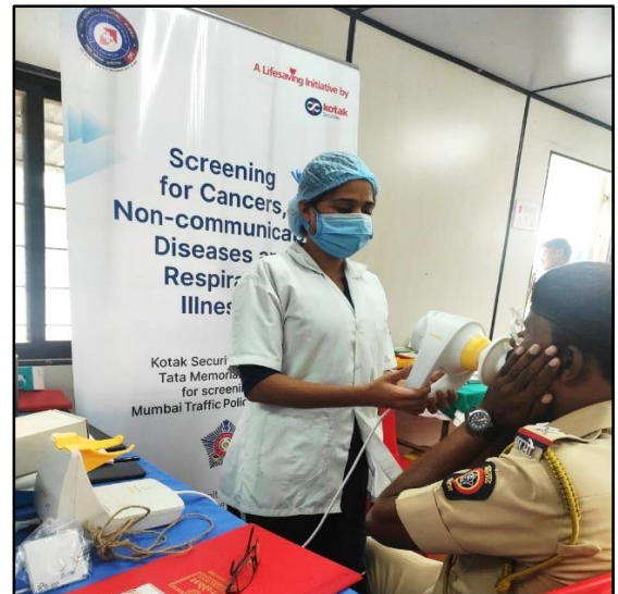
Performing FOT Test