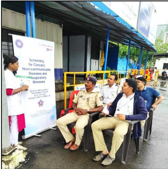
Health Education Given by MSW