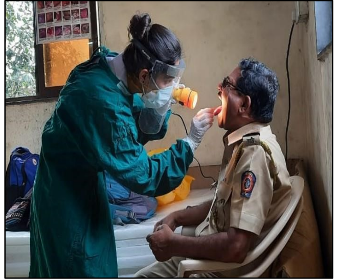
Oral Cavity Examination by Health Assistant