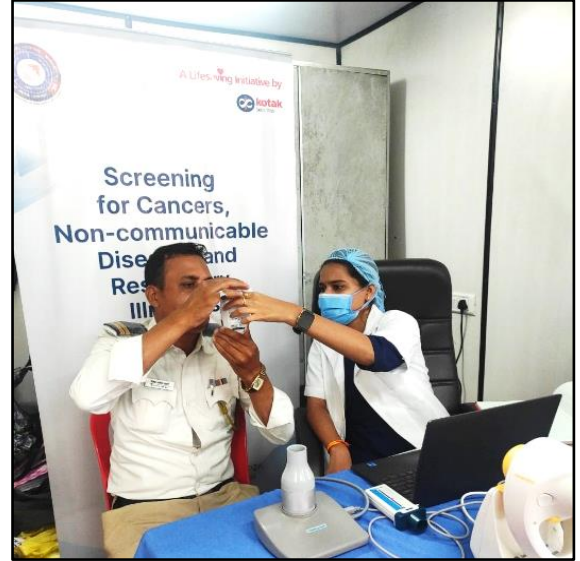
Performing Breath CO