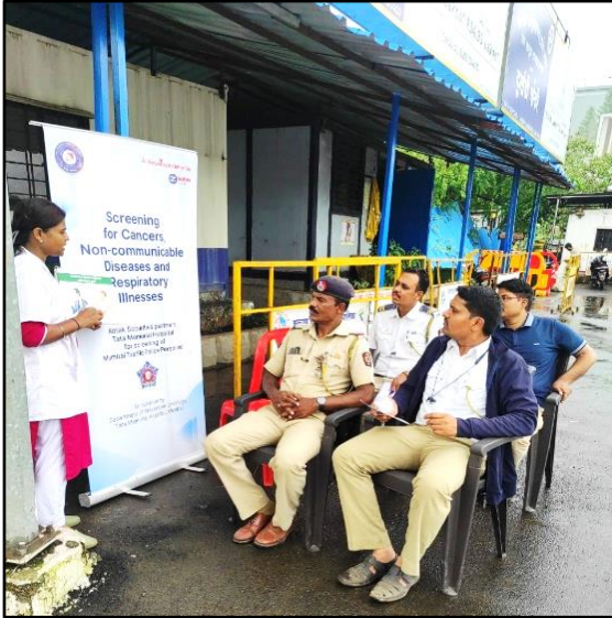
Health Education Given by MSW