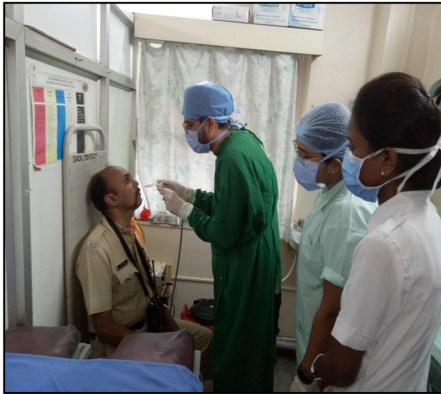
Referred Follow-up in TMH