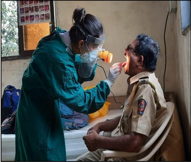
Oral Cavity Examination by Health Assistant