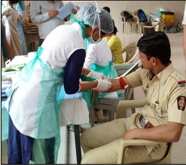
Blood Collection by Health Assistant