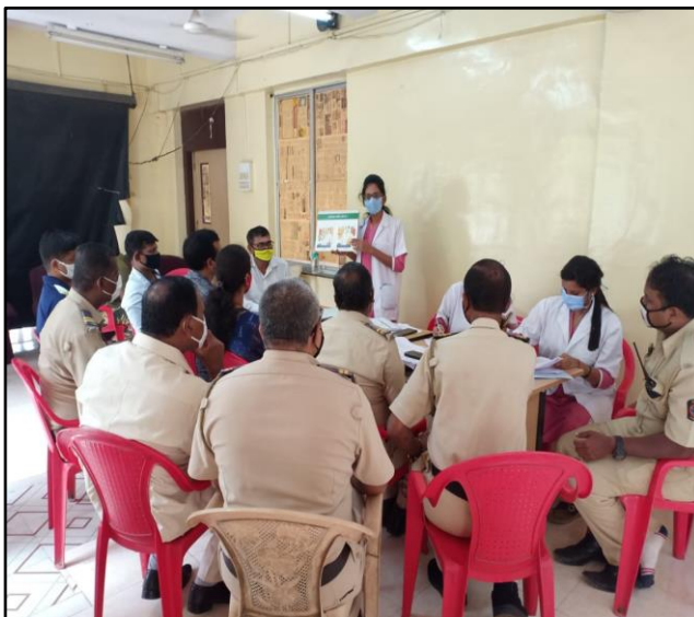
Health Education by MSW