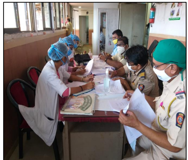
Registration and obtaining Informed consent