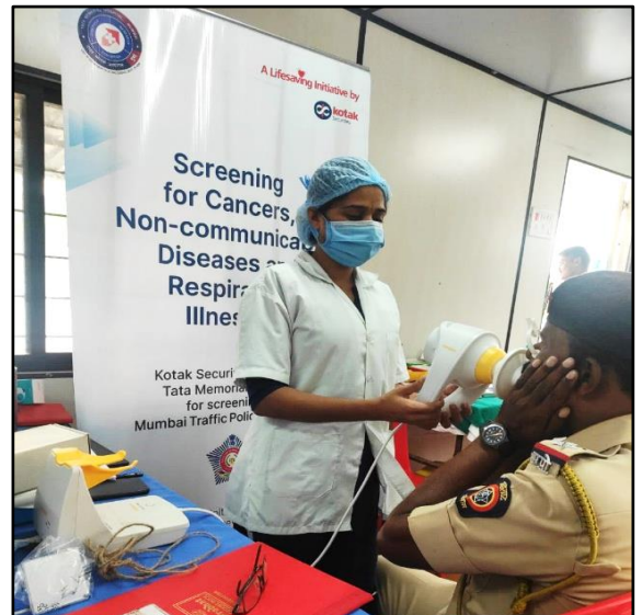
Performing FOT Test