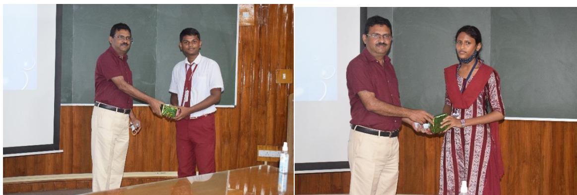
(Caption : Some winner receiving Prizes during Quiz program)