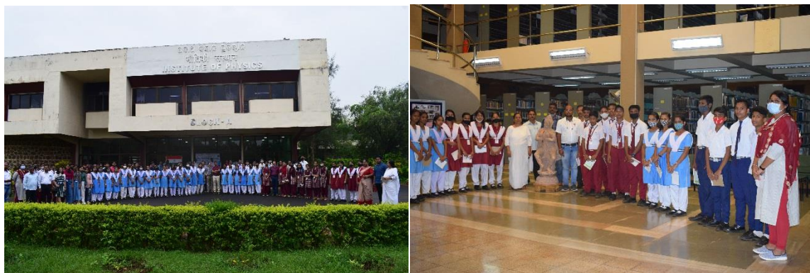
(Caption: Group Photo of participants)