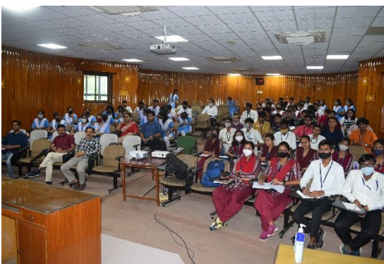
(Caption: Academic Program for Jr. Student Banner, Director, Registrar delivering their Inaugural Talk)