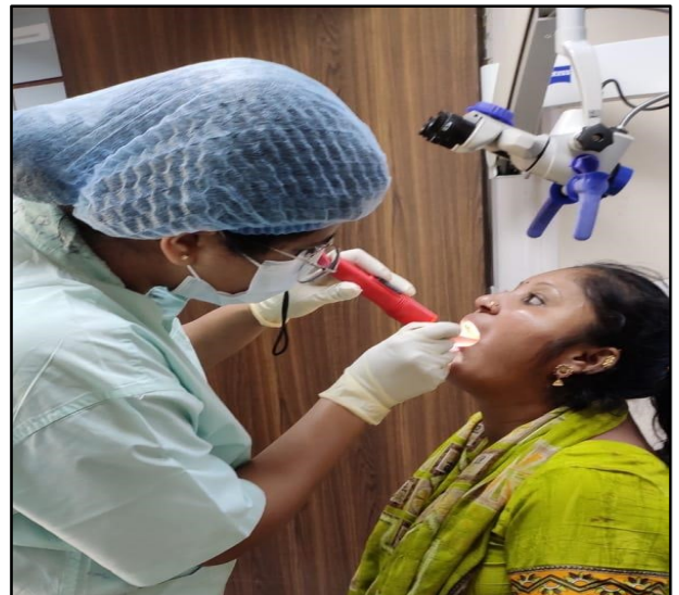
Referred Participants Screened by TMH Doctors