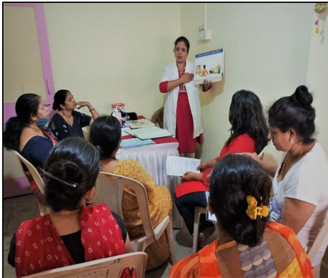
Health Education by MSW