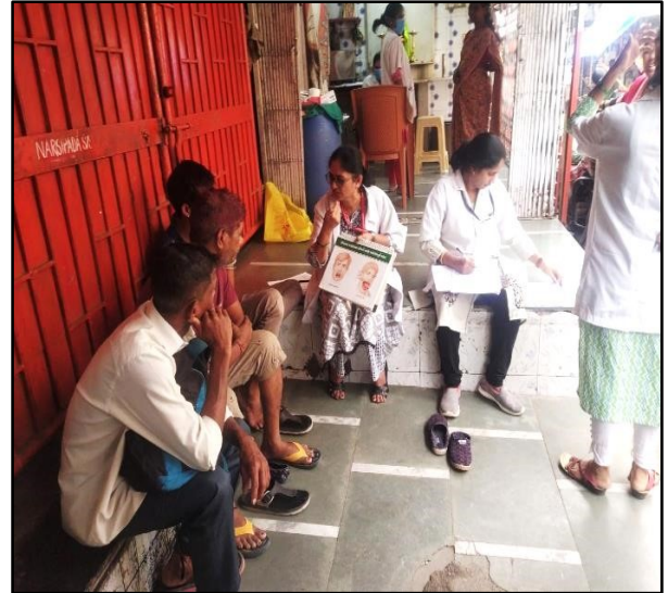
Health Education by MSW