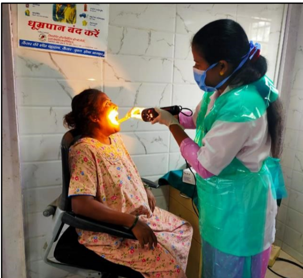
Oral Cavity Examination by Health Assistant