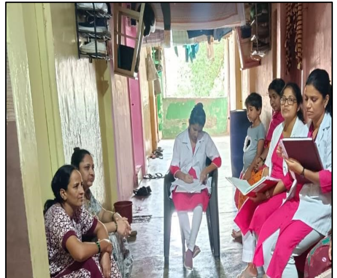
Registration and obtaining Informed consent