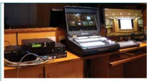
Fig. 2: Video streaming Facility