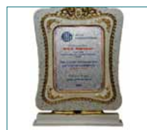
Fig. 3: ASTM International Honour to IGCAR