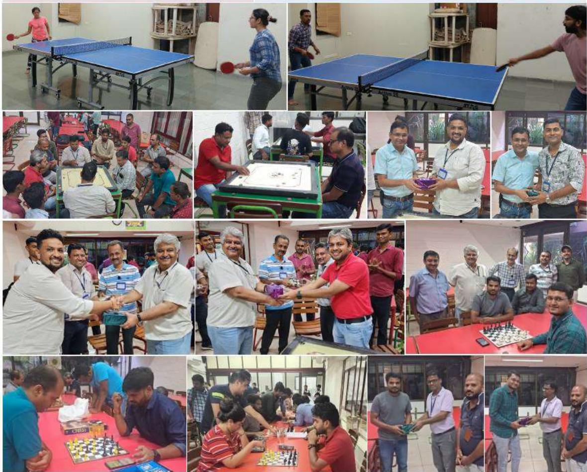
Glimpses of the Staff Club Indoor tournaments