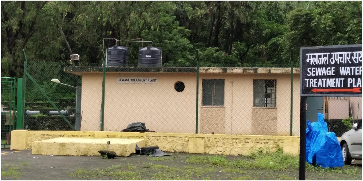
Sewage Treatment plant- B ARC-Anushaktinagar, Mumbai