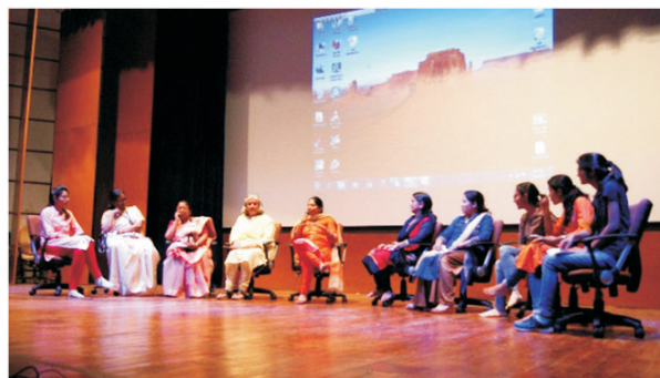
The panel discussion on "Generation gap at the workplace and stress".