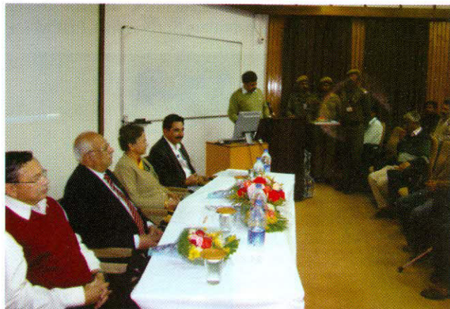
Inaugural Session in progress