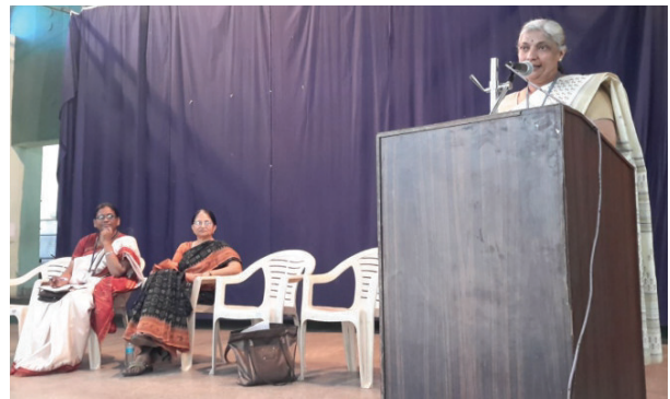
Senior woman employees of RRCAT interacting with participating women engaged in construction and cleaning activities in the RRCAT campus