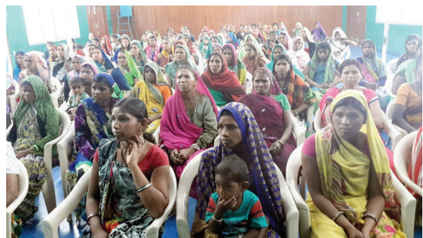
Participants in the Workshop on Swachhata Abhiyan organized on March 8, 2017 for women work-force engaged in construction and cleaning activities in the RRCAT campus

The photographs show senior women employees of RRCAT interacting with the large number of women work-force engaged in construction and cleaning activities in the RRCAT campus in the workshop organized at Welfare Centre in RRCAT in celebration of the Women's Day.