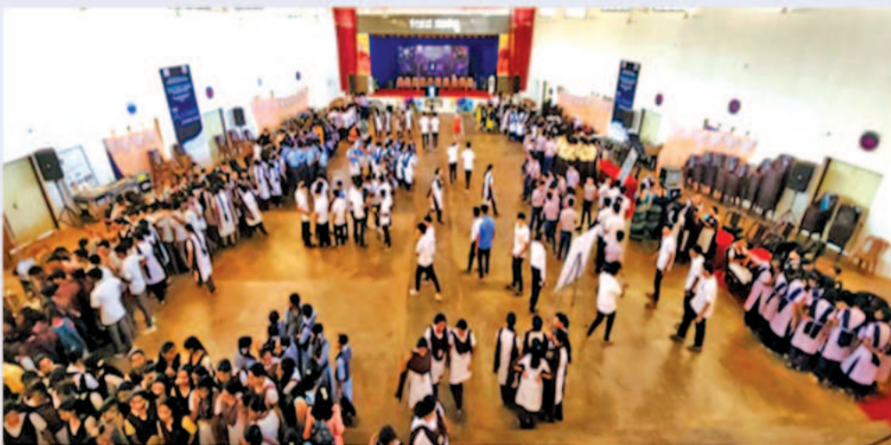
Plasma exhibition at Vivekananda College of Arts, Science and Commerce, Puttur, Karnataka during August 30-September 1, 2023