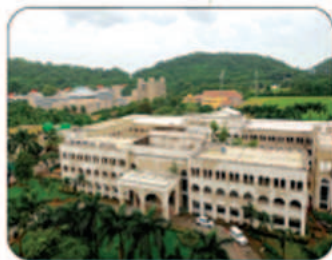
HBNI Central Office