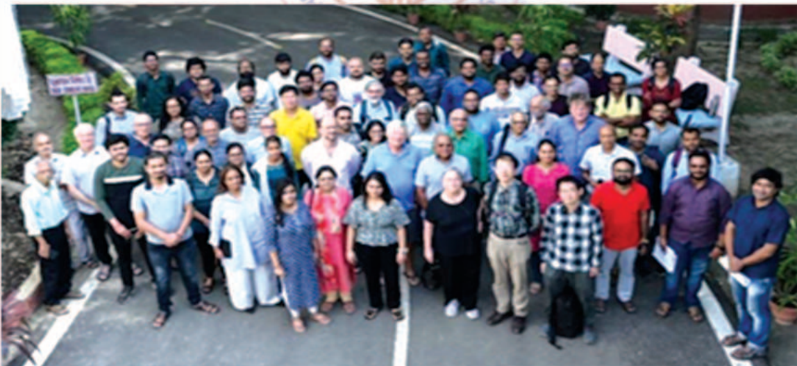
Participants of International conference on Representation Theory and Harmonic Analysis

The international conference on “Representation Theory and Harmonic Analysis” was organized at HRI from October 9, 2023 to October 14, 2023. Several eminent Mathematicians (national and international) attended the conference. This was an excellent exposure to the Indian mathematicians. Covered topics included Representation theory of Real Lie groups, Harmonic analysis, Automorphic forms, Langlands correspondence etc. There were around 100 participants including 4 Indian speakers and 17 international speakers.