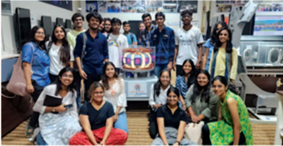
Students of Ahmedabad University, Ahmedabad during their visit to IPR, October 25, 2023