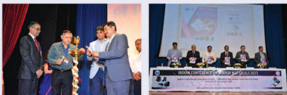
Dignitaries lighting the lamp during the inaugural session of the conference (left) and releasing the conference proceedings (right)