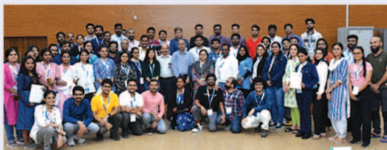
Participants of the National Workshop on AMMM-2023 organized at BARC Mumbai