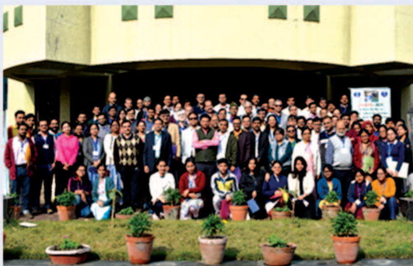
Participants of the theme meeting SUCCESS-2023

A special session was also organised for PhD students, postdoctoral fellows, and young faculty members (age below 35 years) to present new and innovative experimental proposals using SCC beam. Out of the seven proposals presented, three best proposals received from Visva Bharati, BARC and ISM Dhanbad were selected and awarded by a bench of experts.