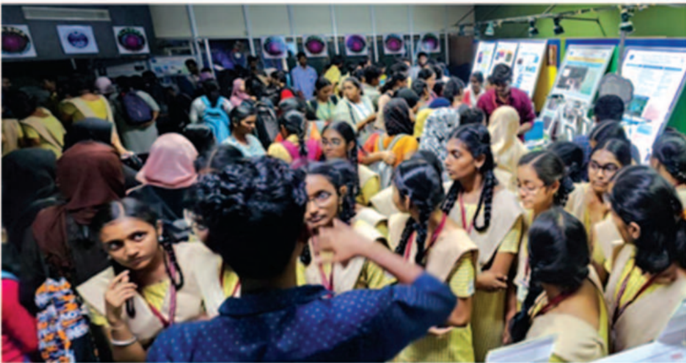
Plasma exhibition at Periyar Science & Technology Centre, Chennai, during July 3-7, 2023