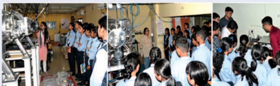
Students of St. Francis School, Dhupdhara, Goalpara, Assam visiting CPP-IPR, July 5, 2023

During the period of July 2023 to December 2023, IPR organized academic visits to IPR and conducted outreach activities for students of various schools and science and engineering colleges all over India. IPR also organized plasma exhibitions at educational institutes all over India with an objective to create awareness about plasma and its applications among the students.