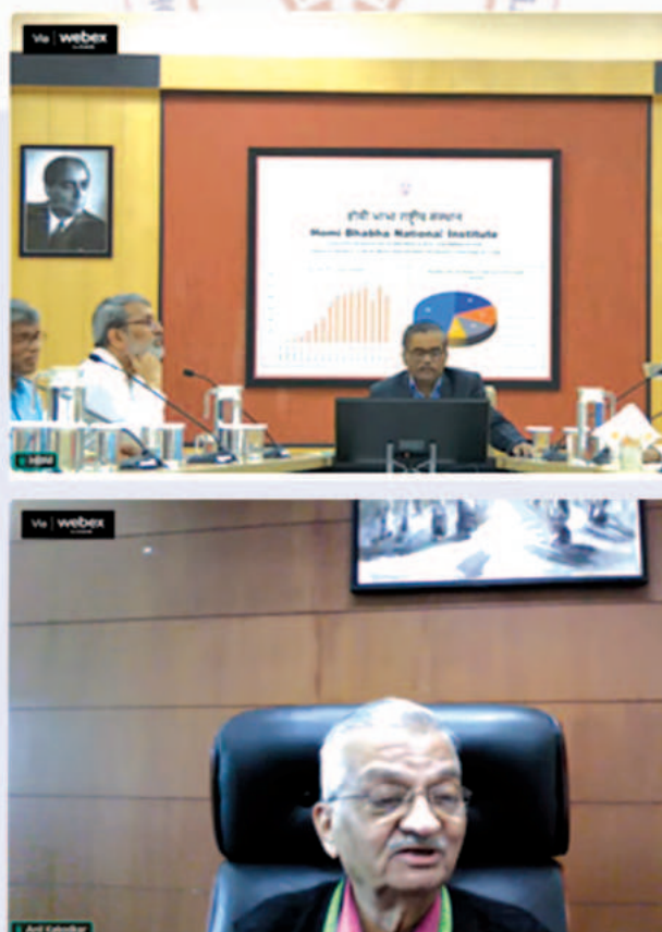
Prof. U. Kamachi Mudali giving introductory remarks (top); Prof. Anil Kakodkar giving inaugural address (bottom);

Eighty participants including science & engineering graduates, emergency handlers from nuclear plants, cement industries, professionals and scientists from CIs and OCC of HBNI and two foreign participants are attending the course presently.